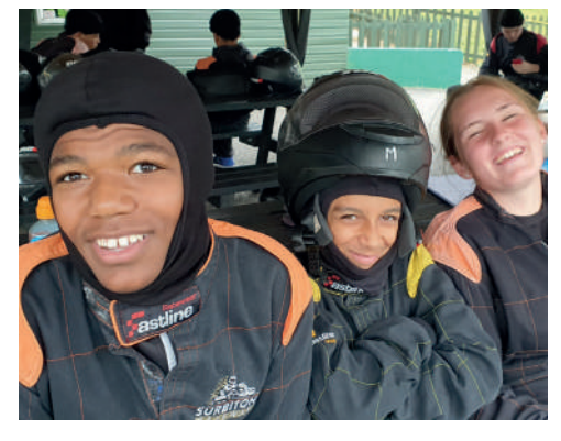
Go Karting, Senior Holiday Scheme, August 2021

We are monitoring the impact of the developing cost of living crisis on our members and, as a result, continue to provide most of our services free of charge. We are aware of the impact on the Club's finances that would be caused by the predicted rise in energy prices. However, we believe these will be moderated by government intervention. If that does not materialise, we are confident we have sufficient reserves to cope should the crisis continue.